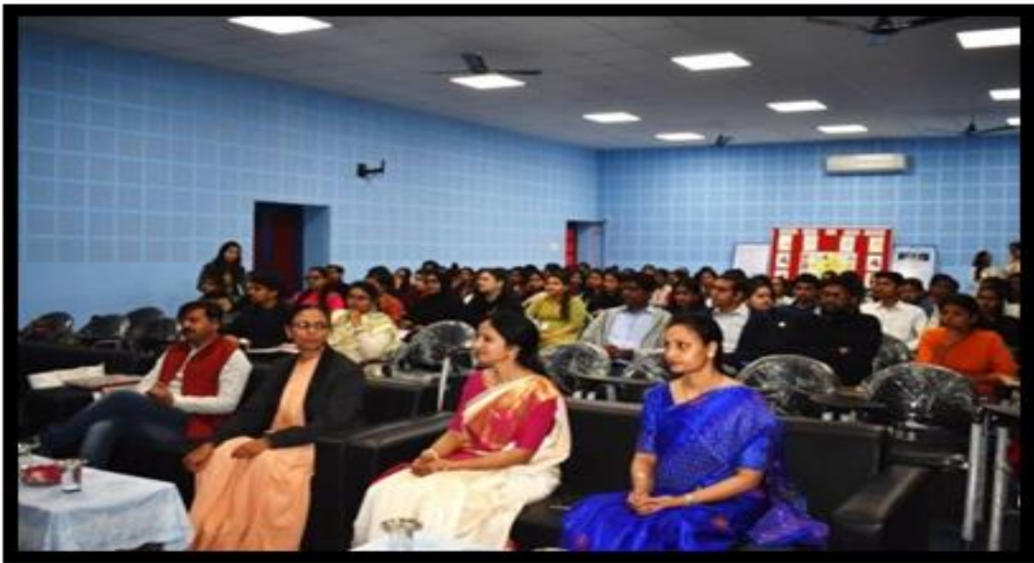
A two-day National Workshop on 'IOTignite' was organized on 22 nd -23 rd February, 2019 by the Department of Computer Science in collaboration with the Computer Society of India.